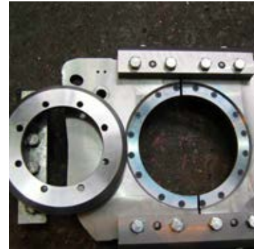
Split Design Re-slurry Bearing