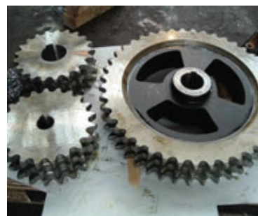
Chain Sprocket Set