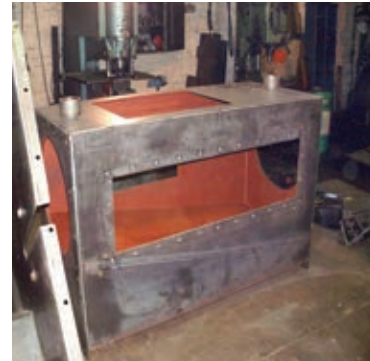
Compactor Body Refurbishment

Replacement discharge tubes are also frequently fabricated and installed by SBT Engineering. These can be either mild steel or stainless steel, with the correct amount of taper to effectively route the waste to the discharge point. SBT tubes come in manageable flanged sections to aid installation and clearing, once installed thus improving the maintainability of the installation.