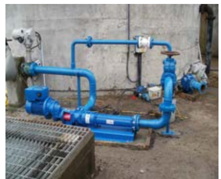
Pump and Pipework Replacement