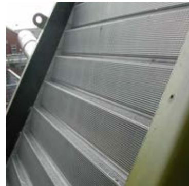
New Set of Elements Fitted