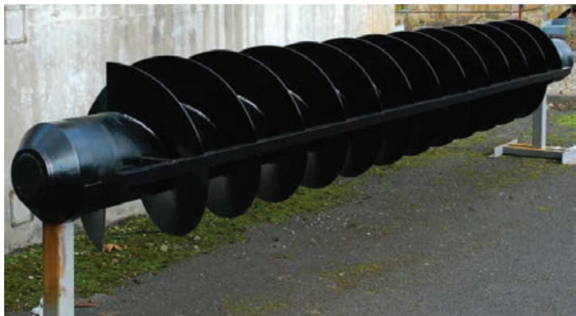
New Archimedes Screw