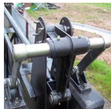
Grit Rake Crank Mechanism