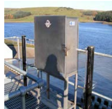
Weather Proof St/St Cabinet (Double)