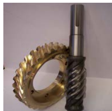
Worm and Wheel Set