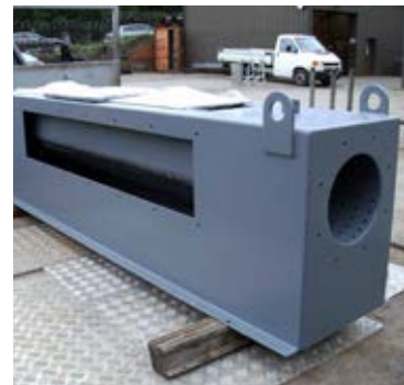
New Compactor Body