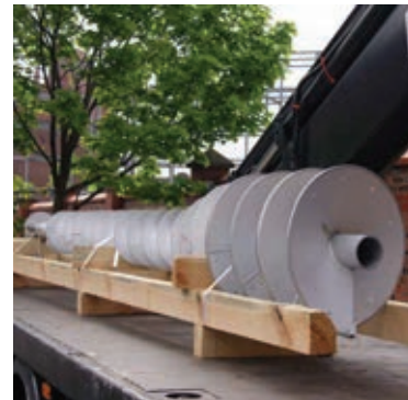
Stainless Steel Auger Assembly