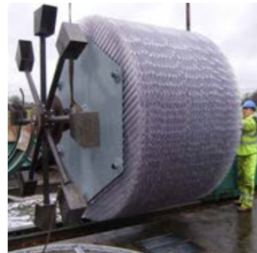
RBC - Repairs and New