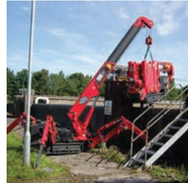
Spider Crane Lifting a Spider Crane