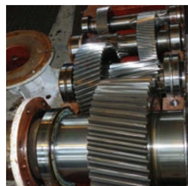
Replacement Gear Set