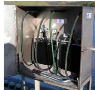
Multiple Penstock Hydraulics