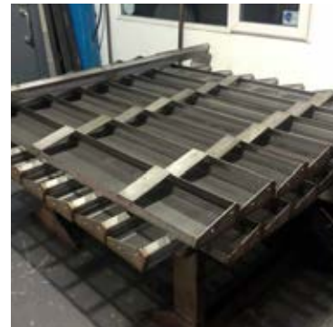
Filter Elements Supplied As Spares