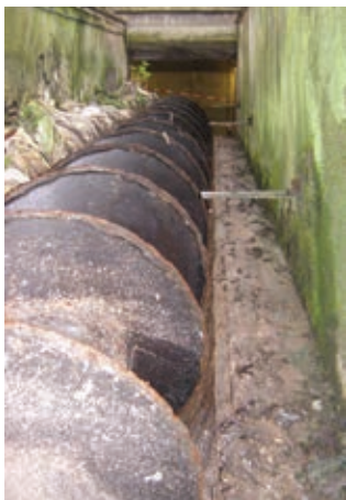
Worn Archimedes Screw