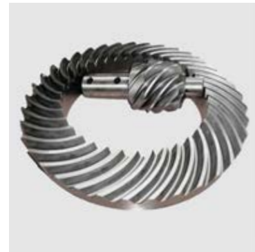
Spiral Bevel Set