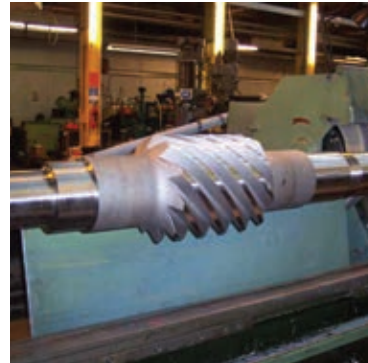
Gear Grinding -Worm