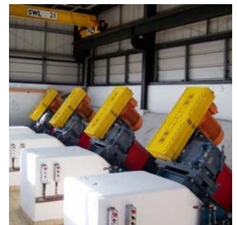
New Screw Pump Drives