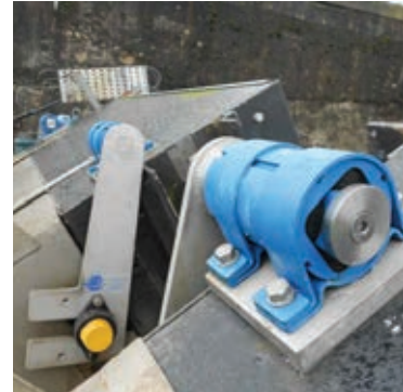
Pivoting Brush Mechanism