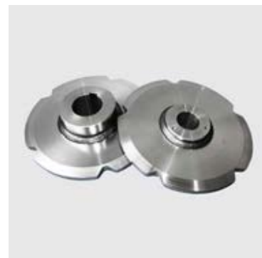
New Chain Wheels