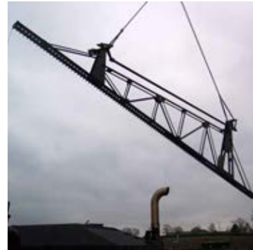
Replacement Grit Rake