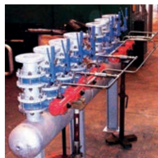
Air Actuated Valve Manifold