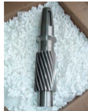
Gear Cut (Replacement Shaft)