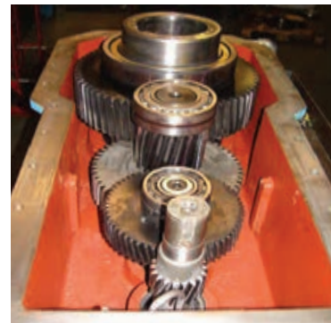
Gearbox, Fully Refurbished