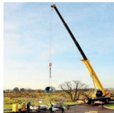
On-site Crane Lifts