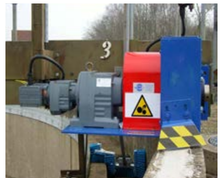
Tank Drive Upgrade