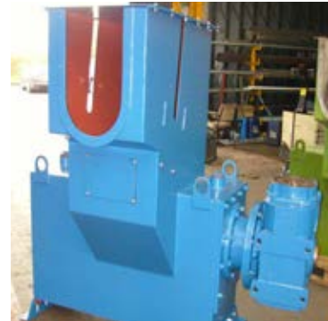
Wash Unit Refurbishment