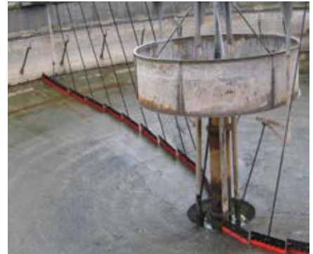
Replacement Scraper System