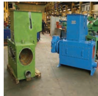
Wash Unit Refurbishment