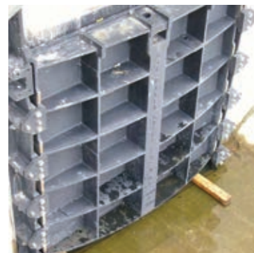
Refurbished Penstock Gate