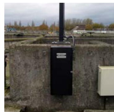
Direct Penstock Control (Single)