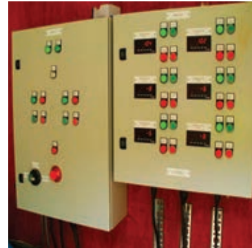
Hydraulic Control Panel

This type of modification has also been carried out at remote reservoirs reducing the manual handling and manpower issues typically associated with opening large valves against an unbalanced head of water, older valves with manual handwheels are operating the valve through a reduction unit, this type of reduction unit means hundreds of rotations of the hand wheel are required to open the valve, by upgrading the valve and converting valves to a rising stem allows the incorporation of a hydraulic cylinder and handpump system alleviating the manual handling issues associated with the operation.