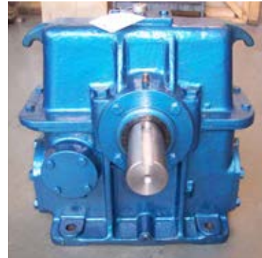
Service Exchange Gearbox

Due to the vast array of equipment installed across the industries served by SBT we are also extremely experienced in manufacturing adaptors and mountings to allow modern solutions to be retrofitted into older, existing installations. The advantage is that there is minimum disruption to the overall installation and/or any associated electrical or control systems.