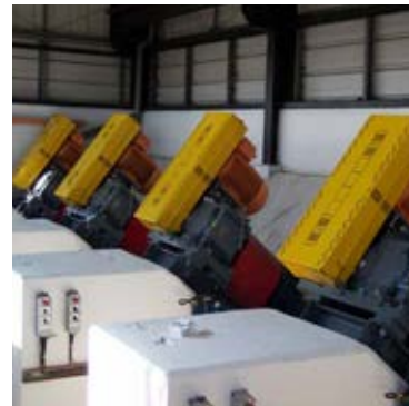
New Screw Pump Drives