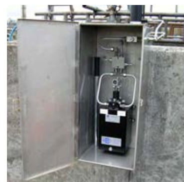
Manually Operated Hydraulic Pump