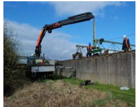
Bridge Carriage Replacement