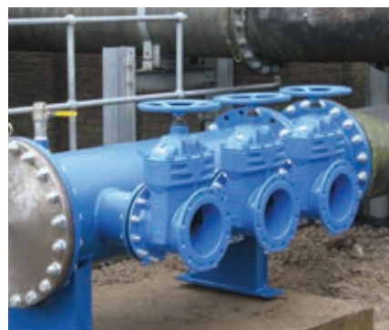
Manifolds Fabricated and Installed