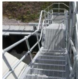
Galvanised Access Stairs

“ We deliver a 24/7 service and never compromise on quality ”