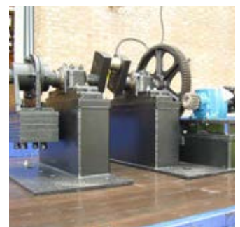
Grit Rake Drive Assembly