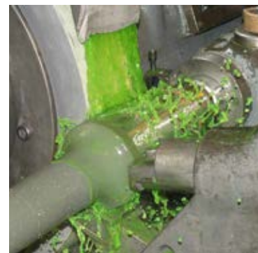
Grinding To Tight Tolerances