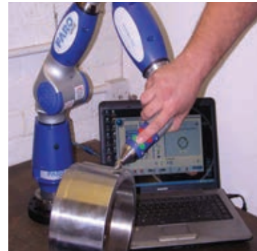
Faro Arm Measurement Service