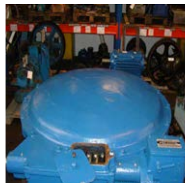
Worm and Wheel Gearbox